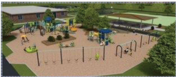
Pictured Above: Butterfly Athletic Park, Computer Animated Drawing

This year's tournament will support the Butterfly Foundation as they continue to partner and provide support to community efforts, which encourage positive youth development.